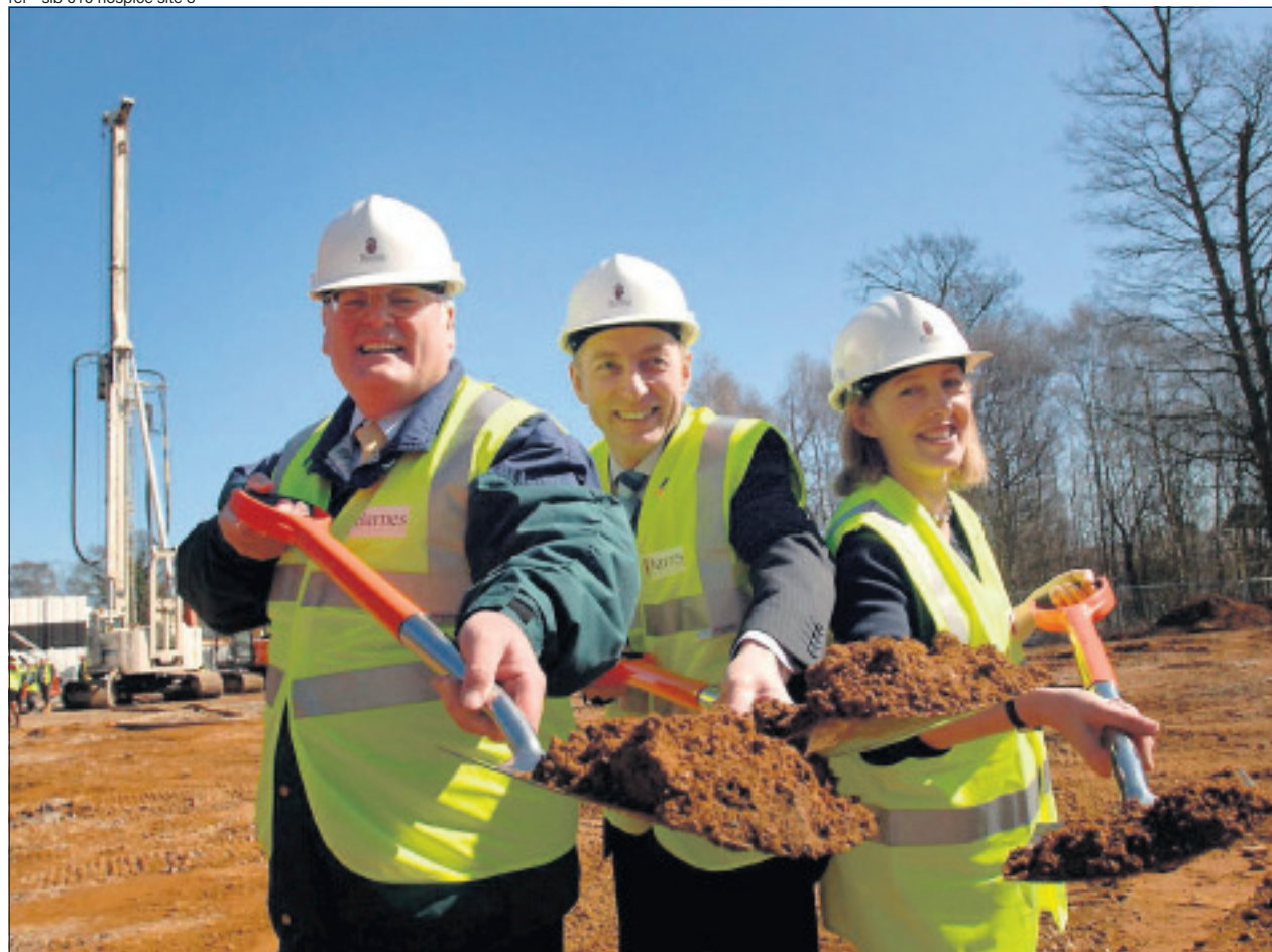
ref - slb 010 hospice site 3