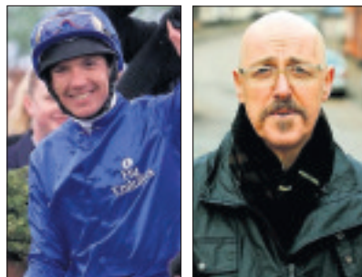
APPEAL SUPPORTERS: Jockey Frankie Dettori and actor Griff Rhys Jones

a modest bungalow in the grounds of Ipswich Hospital.